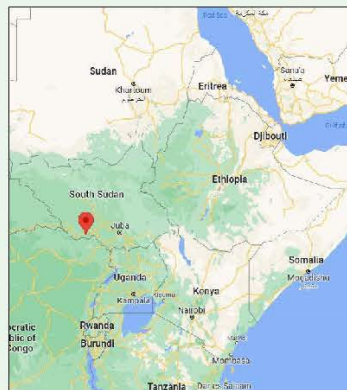
Location of well in Madebe, Africa