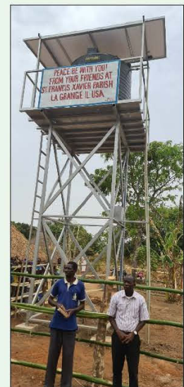
The Madebe Parish thanks the SFX Community